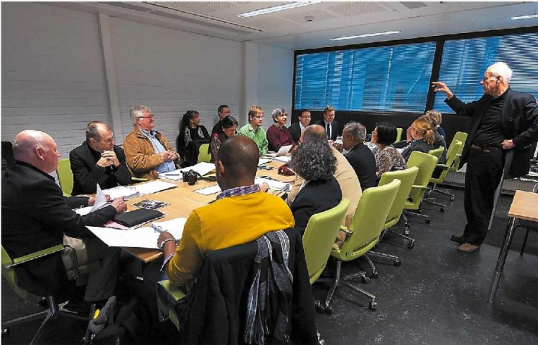
Launching workshop held in Tampere 2012, followed by conferences in Moscow, Dublin (2013), Hyderabad (2014), Rio (2015) and Beijing (2016)

This project is funded by the Academy of Finland in 2012-2016. It focuses on the new coalition in global politics made up of Brazil, Russia, India, China and South Africa, challenging the Western ways of approaching media and the role of journalism in society. With leading scholars from the BRICS countries it examines the theoretical concepts of a media system, freedom and democracy and the empirical situation of contemporary media landscapes, particularly journalists.